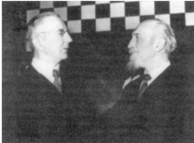
Bank of England Gov. Montagu Norman (right) with Reichsbank President Hjalmar Schacht. Norman, a former partner of Brown Brothers, was the most avid of Hitler's supporters within British ruling circles; Schacht, who became Hitler's Economics Minister, was Norman's protégé.

that we have drawn our line and should hew to it." 10