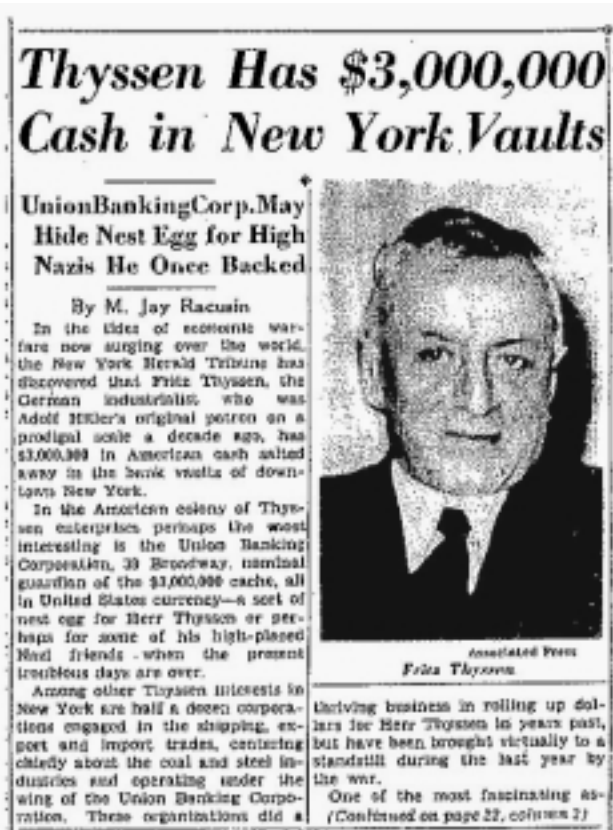
The front page of the New York Herald Tribune, July 31, 1941, identified the Bush-Harriman banking complex at 39 Broadway as the headquarters for Hitler’s chief fundraiser, Fritz Thyssen, through the front company Union Banking Corp. Prescott Bush managed this and other Nazi facilities; the entire banking complex was set up by George Herbert Walker, W’s great-grandfather.

The Union Banking Corporation was established formally in 1924, as a unit in the Manhattan offices of W.A. Harriman & Co., interlocking with the Thyssen-owned Bank voor Handel en Scheepvaart (BHS) in the Netherlands. The investigators concluded that “the Union Banking Corporation has since its inception handled funds chiefly supplied to it through the Dutch bank by the Thyssen interests for American investment.”